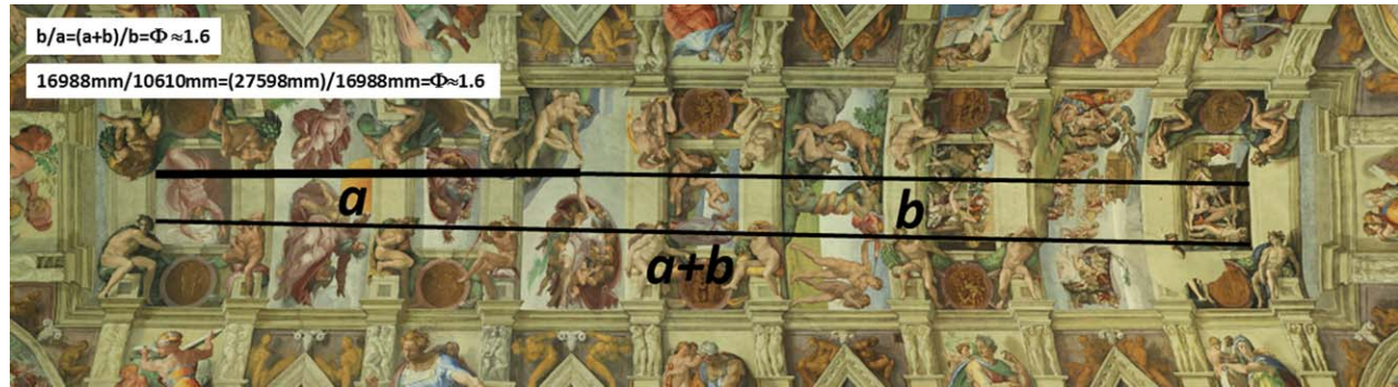
Fig. 3. The ceiling of the Sistine Chapel (1508–1512). Michelangelo Buonarroti. Extracted from Barreto and Oliveira, 2004. As in Figure 2, all measurements were taken with the aid of Image Pro Plus Software 6.0; Media Cybernetics, Silver Spring, MD, USA. To calibrate the

something considered divine ( GR ) and so, in fact, Meshberger's Theory, which suggests Adam is receiving the "divine part," the intellect (Meshberger, 1990; Strauss and Marzo-Ortega, 2002), from God, would be correct.